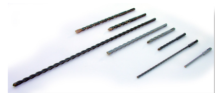
Heavy Duty Drill Bits