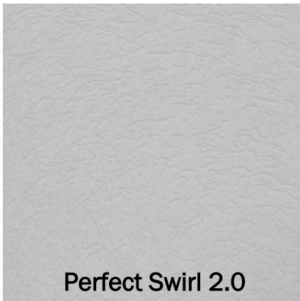
Perfect Swirl 2.0