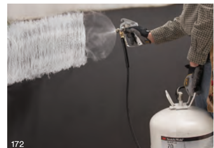
172 Consistent spray patterns and portable cylinders mean you can realize big improvements in efficiency and save time and labor costs.