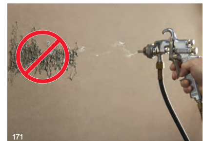
171 3M™ Cylinder Spray Adhesives do not atomize spray patterns with added airline. This means you get consistent even spray patterns, potentially saving rework and cleanup.