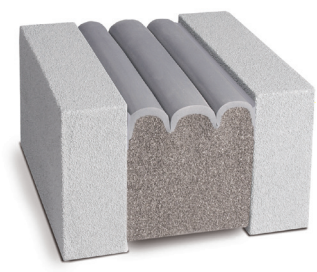
DSM SYSTEM sample shown here is displayed in substrate mock-up