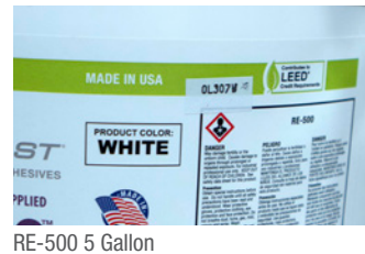
RE-500 5 Gallon

Hardcast provides a large assortment of products to our customers across separate segments of the product spectrum (i.e. water-based sealants, solvent-based sealants, water-based adhesives, solvent-based adhesives, aerosolized adhesives, and a plethora of hardware items). The batch/lot codes on these products will vary by product type and use. This document will address how to decode the batch codes dependent on the product type as well as the expected shelf-life. The accompanying pictures will give you the visual needed should you ever need to obtain a batch/lot code for review.