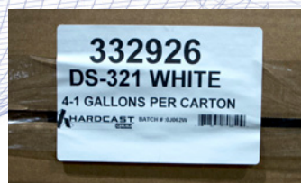
4-1 Gallon Carton 2