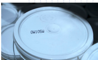
2 Gallon Sealant