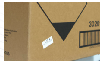
Solvent Cartridge Case