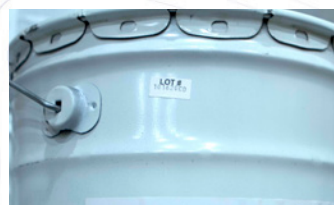
5 Gallon Adhesive