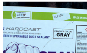
50-Gallon Drum Sealant