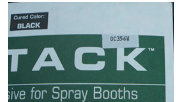
50-Gallon Drum Adhesive