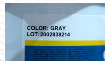
Soudal 4-1 Gallon Carton