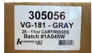
Sealant Cartridge Case