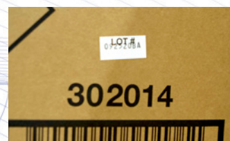
Sure-Grip™ 404 Tubes Case