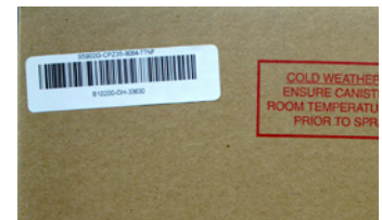
40 lb Aerosol Adhesive