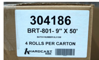
Rolled Sealant Case 1