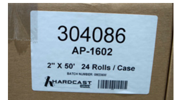
Rolled Sealant Case 2