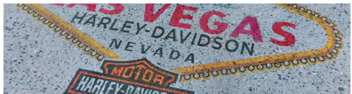
DURO-FLOOR COLOR SYSTEM

HARBETON is a fluorosilicate-based hardener which chemically reacts with calcium carbonate present in concrete resulting in a chemical reaction that hardens, densifies and dustproofs concrete floors. HARBETON is ideal for use in warehouses, distribution centers, auto dealerships, manufacturing plants, parking garages and bottling plants. Leaves no residual film and creates an improved surface for mechanical bonding.