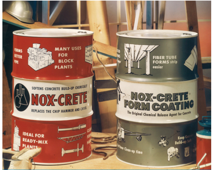
DEACTIVATOR • FORM COATING