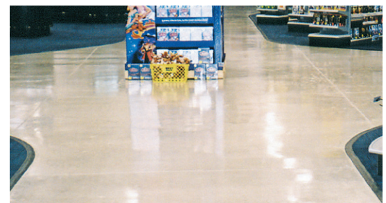
DURO-FLOOR CLASSIC SYSTEM