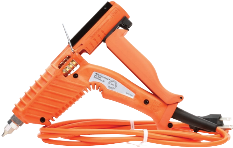
3M™ Hot Melt Applicator TC with Quadrack Converter