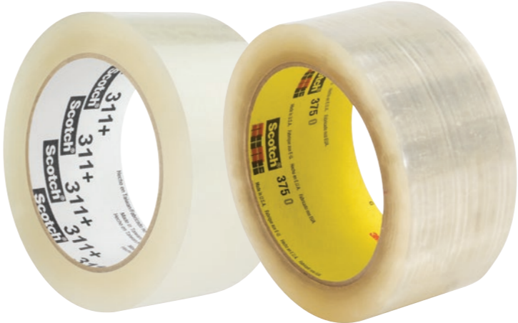
Scotch® Box Sealing Tape 311+, 375