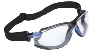
3M™ Solus™ Protective Eyewear Kit, 1000 Series