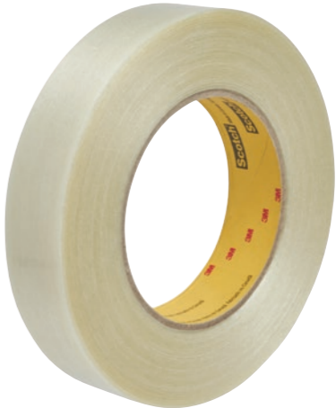
Scotch® Filament Tape 898