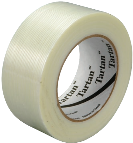
Tartan™ Filament Tape 8934