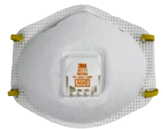
3M™ Particulate Respirator 8511, N95