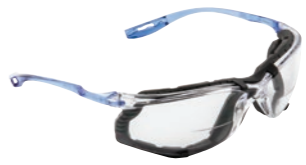
3M™ Virtua™ CCS Protective Eyewear