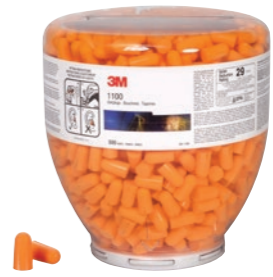
3M™ Foam Earplugs 1100