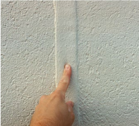
EIFS joint restored using DOWSIL™ 123 Silicone Seal