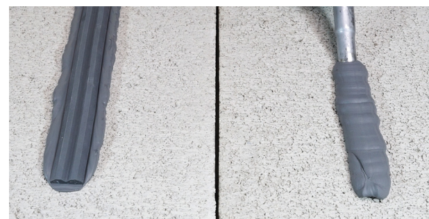
SealBoss® SwellTape™ embedded in SwellCaulk™

SealBoss® SwellCaulk™ must be completely confined to perform properly. When used in precast or joints, minimum concrete cover is 3" or 7cm on all sides. Unconfined material may expand beyond design levels and may result in leaks. The product is not suitable for surface caulking applications. At temperatures below 40°F, the product cure time may exceed several days.