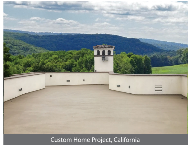
Custom Home Project, California