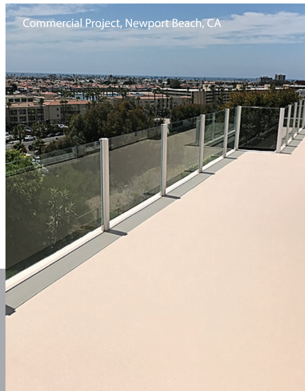
Commercial Project, Newport Beach, CA

"Their products are quality products. They make great waterproofing systems, sealers, and epoxies. That's what really stands out for us."