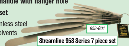
Streamline 958 Series 7 piece set