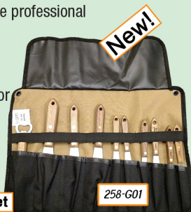
Classic 258 Series 9 piece set