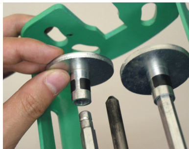
Patented Snap In/Snap Out Push Disks