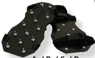
A. / B. / C. / D.