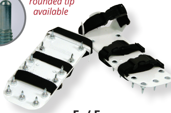
E. / F.