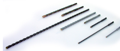
Heavy Duty Drill Bits