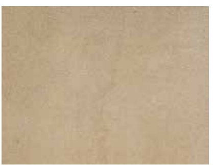
Sahara | 518