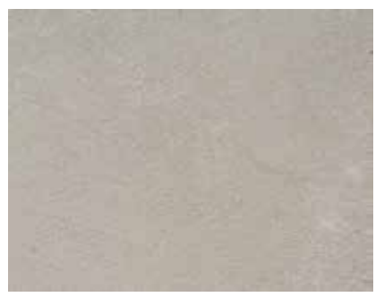
Shale | 516