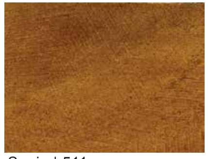
Sepia | 511