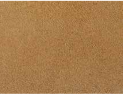
Camel | 505