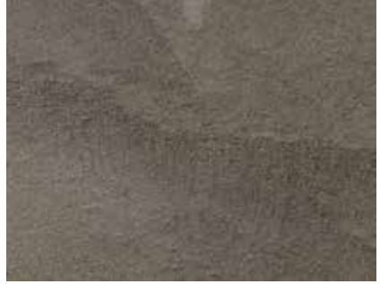
Onyx | 509