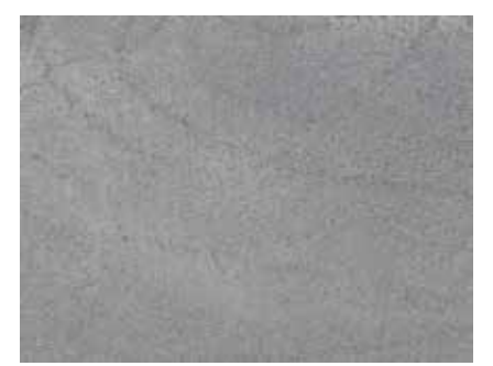
Armor | 514