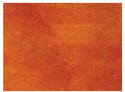
Copper | 508