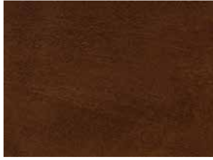
Mahogany | 501

Not shown but also available in lvory | 517