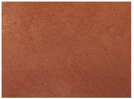
Adobe | 515