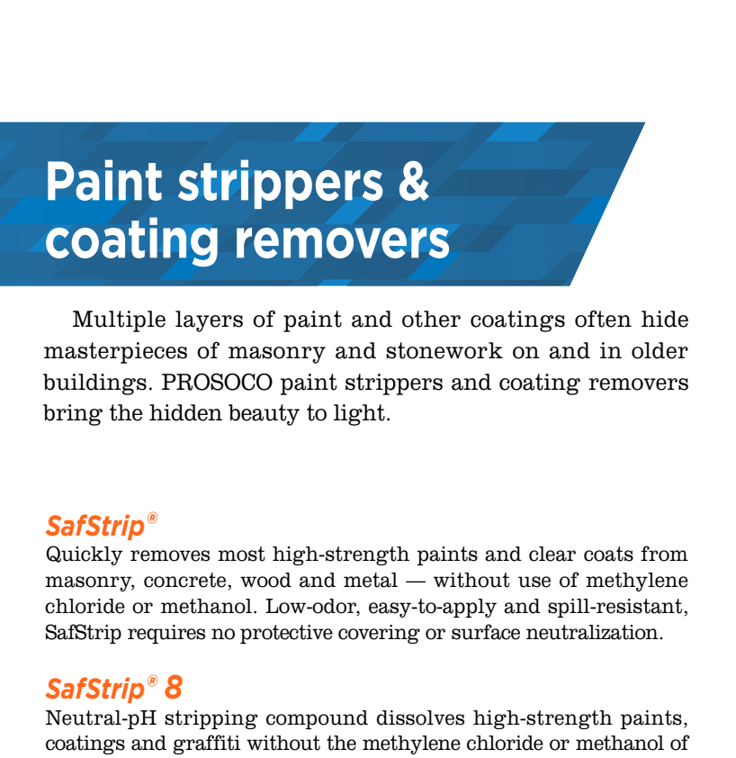
traditional paint strippers. Gel consistency means it's easy to apply and hard to spill.