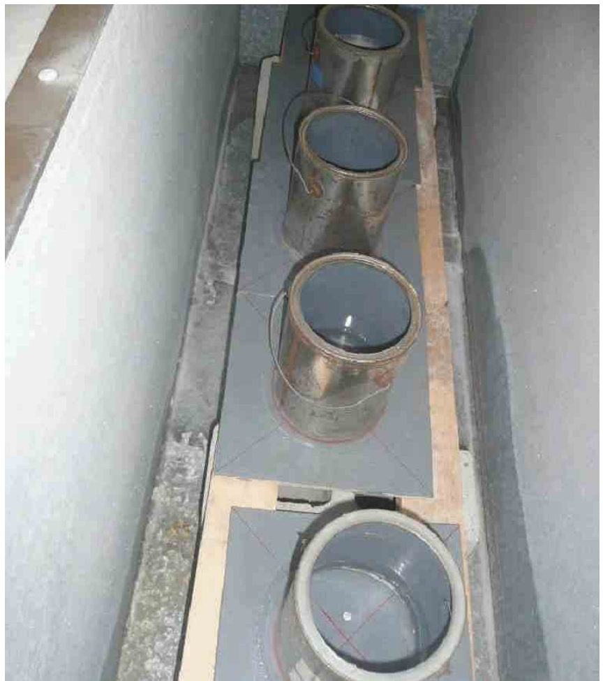
ASTM D1970 test apparatus. This test measures the ability of a barrier material to self-seal around two nails in a manner sufficient to prevent a column of water from seeping through the penetration.

First, a set of 59 fasteners commonly used in construction was selected for evaluation. Second, a set of 8' x 8' test panels were constructed per ASTM E331, using both wood and 16-gauge steel studs, and exterior-grade gypsum sheathing. Senershield-R/-VB/-RS and other air barrier materials were applied to the panels and allowed to dry. Once dry, the fastener set was applied to each panel. These panels were tested for resistance to simulated wind-driven rain.