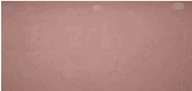
ASTM E2357 panel made using Senershield-VB with 75 penetrations

Senershield-R/-RS/-VB demonstrated self sealing capabilities after penetration by nails, screws, and staples. While this test data does not replace the need for careful jobsite installation and professional inspection, it demonstrates that Senershield-R/-RS/-VB air/water-resistive barrier materials are capable of self-sealing when penetrated by a variety of screws and fasteners.