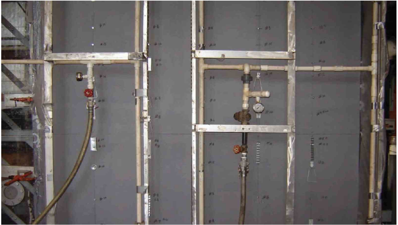
ASTM 331 test apparatus