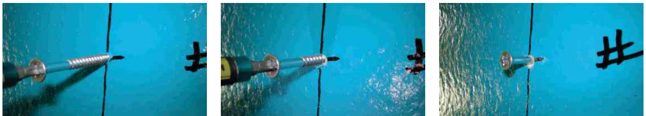
Air barrier leak caused by screw penetration

Overall, the lowest level of performance was provided by the mechanically-fastened wrap, which exhibited leakage at numerous penetrations starting at the lowest pressure.