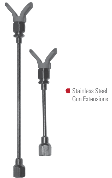
Stainless Steel Gun Extensions

*Standard with sprayer, excludes ball. Ball check sold separately (920-103).