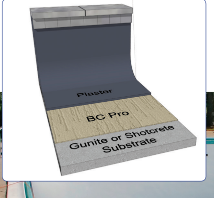
Plaster to Plaster Application