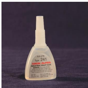
*Aron Alpha 241 Glue (P/N – 2876J)