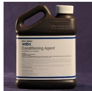
Wabo® Conditioning Agent (P/N – 2802J)