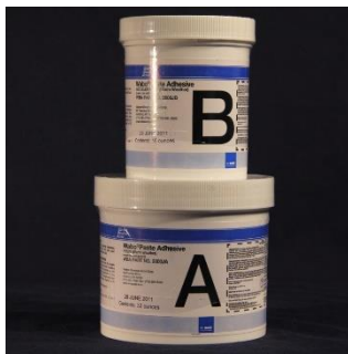
Wabo® Paste Adhesive Package (P/N – 2800J)

The following components are required for the installation of this product: