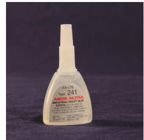
*Aron Alpha 241 Glue (P/N – 2876J)

Surface to be spliced. — Note: Make sure that profiles match to ensure good adhesion.