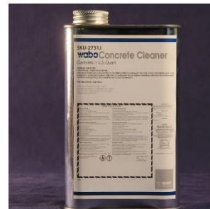
Wabo® Concrete Cleaner (P/N – 2731J)

*Optional components for splice procedures. Place order for required quantities.