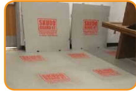
Fire retardant, water & slip resistant