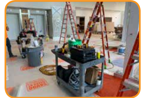
Extremely high impact resistance