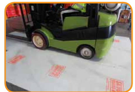
Superior protection under forklift and construction traffic