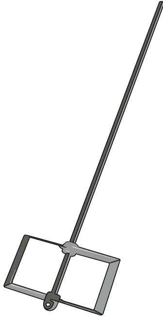
Top: Jiffy Style Paddle Bottom: Mud Mixing Paddle