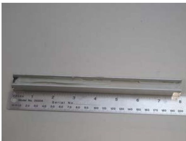
Photo Documentation – The product sample specimen is photographed immediately following specimen preparation and prior to initiating the conditioning period. Typically, the top and bottom faces of the specimen are photographed. Bottom faces may show a stainless steel plate or other substrate if prescribed by the standard.