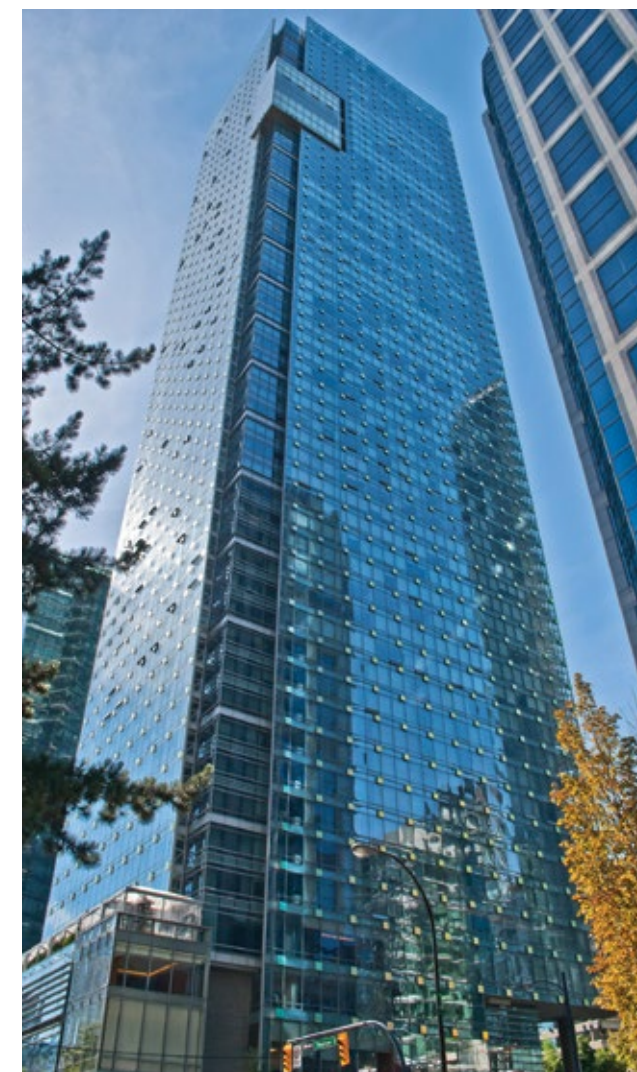
LEFT Designed by James K. M. Cheng Architects Inc., the visually stunning Living Shangri-La hotel, located on the Vancouver waterfront, was built using Curtainrock and ROXUL Safe products as its specified insulation. RIGHT Located in the heart of Toronto, The Ritz-Carlton Hotel and Condominium was built using both Curtainrock and ROXUL Safe as part of the perimeter fire containment system.

Water repellent yet vapor permeable, our insulation materials offer inherent drying potential, which means should they get wet and be allowed to dry, the insulation will retain its stated performance as long as the materials are not damaged. Stone wool is also resistant to rot, mold and mildew growth — contributing to a safer indoor environment.