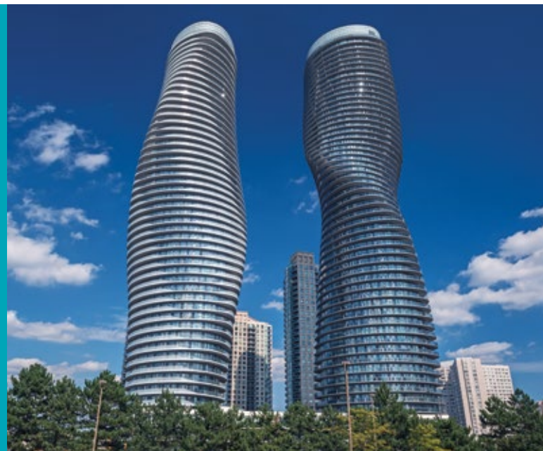
Absolute World Residential Tower: Ontario, Canada

Contact ROCKWOOL Building Science by visiting rockwool.com/buildingscience