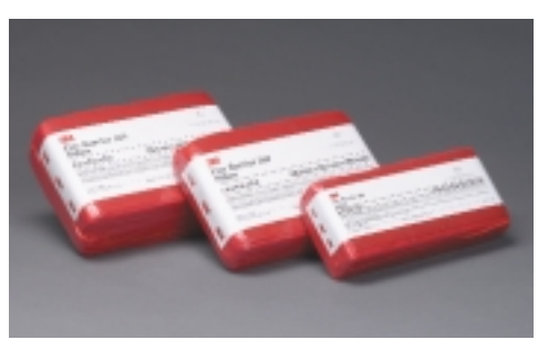
3M Fire Barrier Pillow family of products.