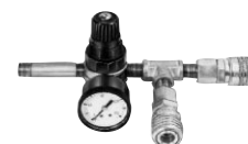
KIT 444-4 FOR TWO GUN Regulator, Gauge and Coupling Without Gauge Kit No. 444-6