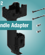
Suitcase Handle Adapter