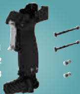
Handle with Regulator