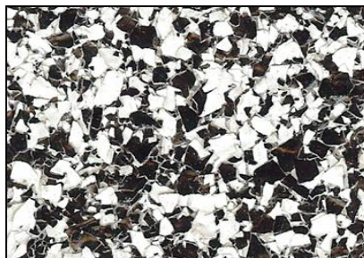
Salt & Pepper