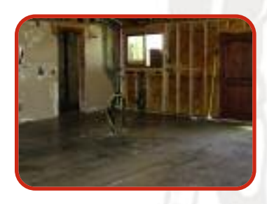
FLOOR-TOP STG makes your floor a new canvas for your art. Now get your creative juices flowing and create a masterpiece!

The light grey color of FLOOR-TOP is an ideal canvas for liquid tints, topical coatings, and acid stains or dyes. Create a finished, decorative floor that is only limited by your creativity. This ability to rehabilitate and also enhance the aesthetic look of the finished floor creates a one-two punch. Not only fix, but also make the floor look better than the original.